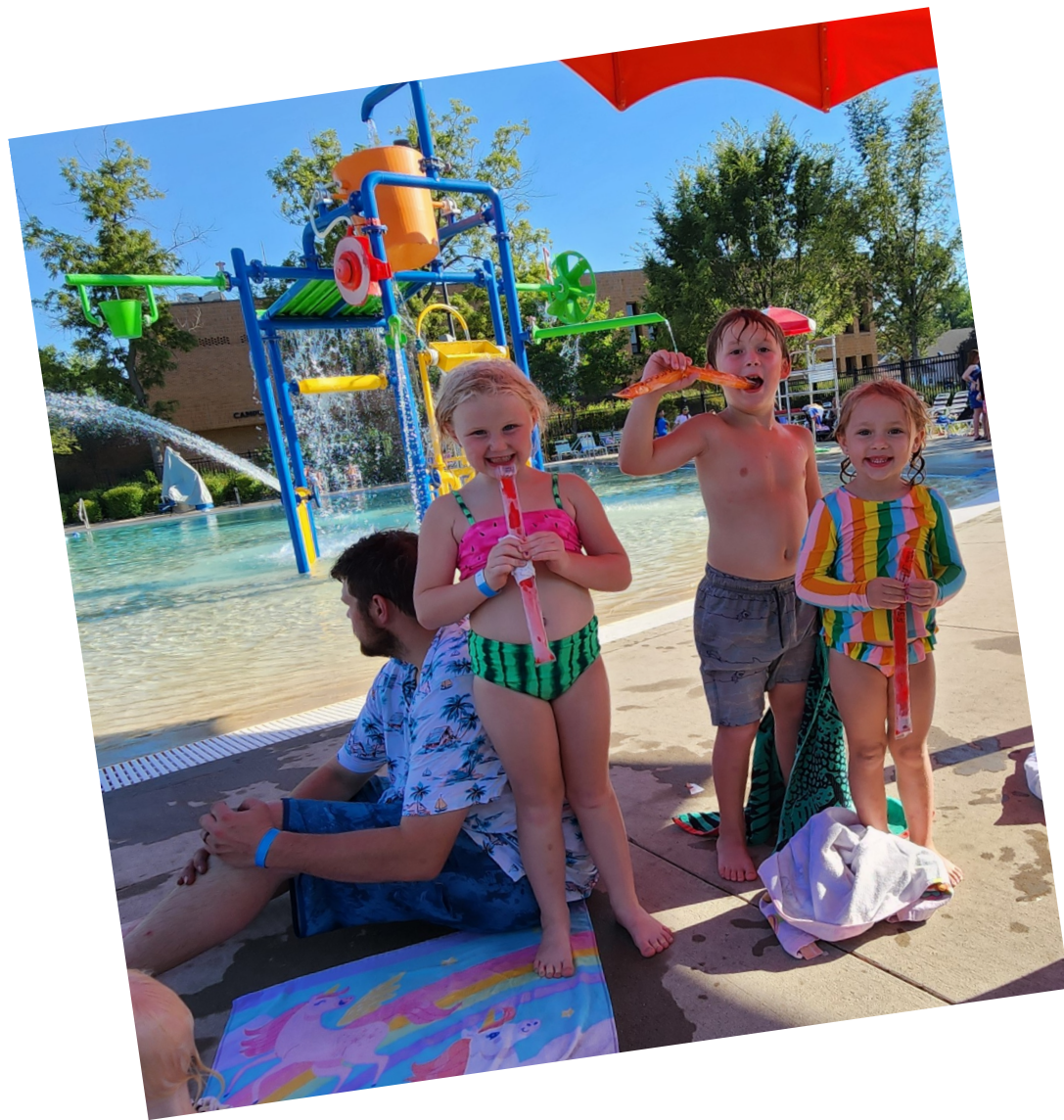
The popsicles were a hit on this hot day! Thank you for the fun and cool treat!